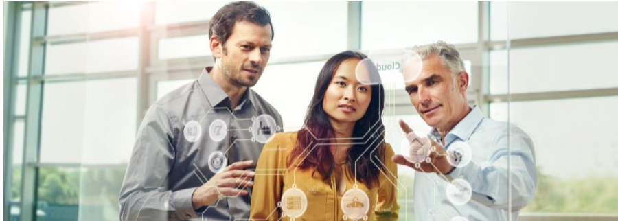
Internet of Things & big data